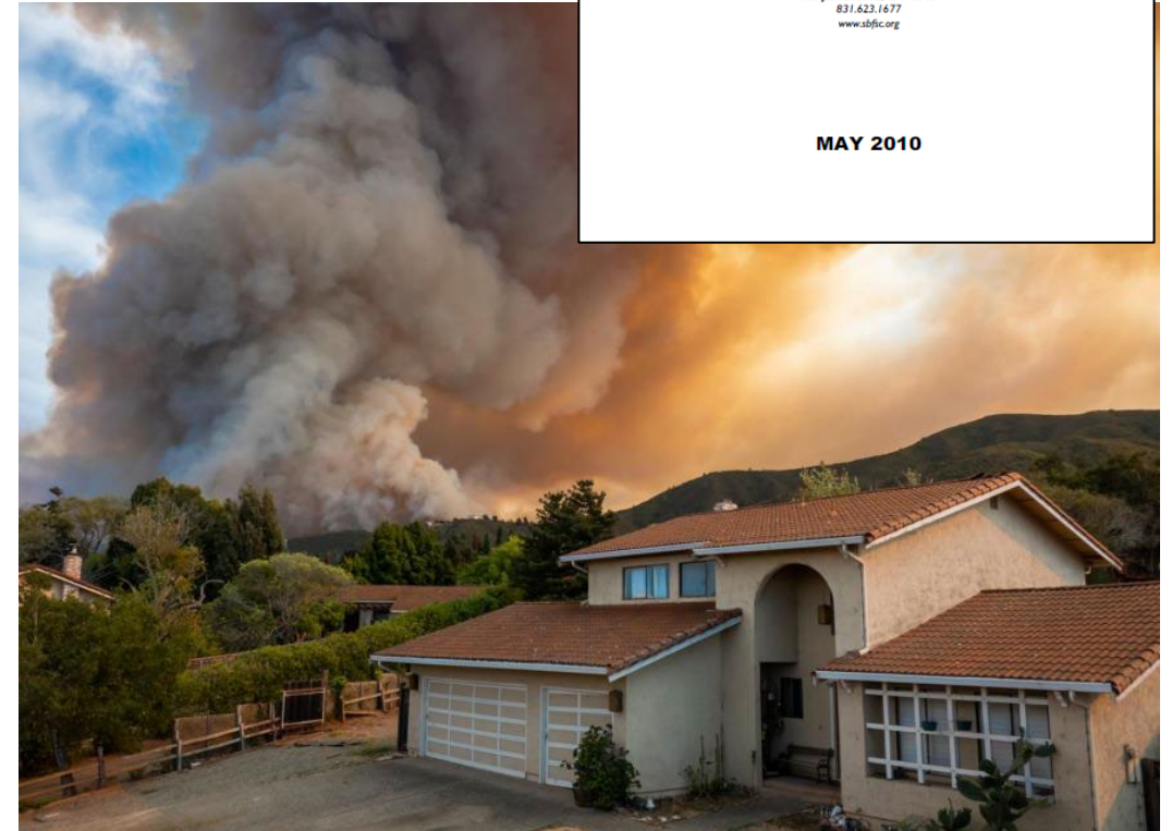
Salinas Fire, 2020